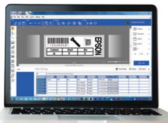
*Screen Content Simulated